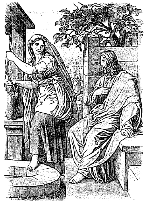
Jesus and the woman of Samaria