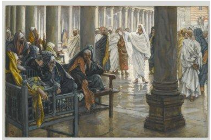
Jesus preaching to the Scribes and Pharisees