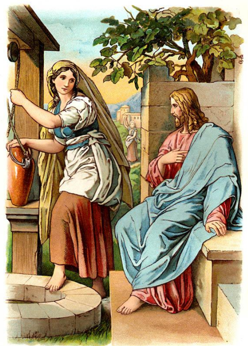
Jesus and the woman of Samaria.