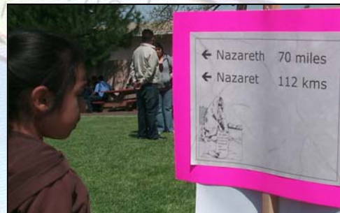
The distance between each Biblical site was given in both miles and kilometers.

Ç Nazareth Jesus' birth is good news. An angel tells Mary about God's plan (Luke 1:26-38).