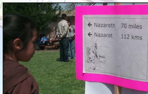
The distance between each Biblical site was given in both miles and kilometers.