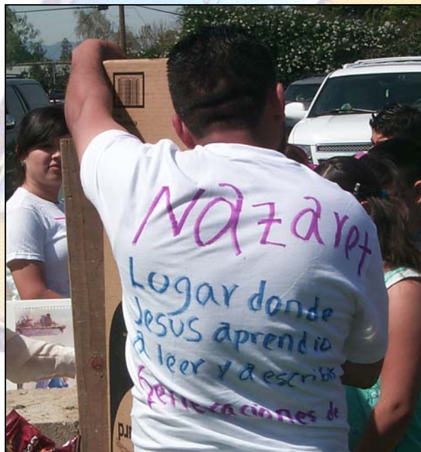
The Gospels are central to the catechetical message. They express the teaching which transmits the life of Jesus, his message and his saving actions.