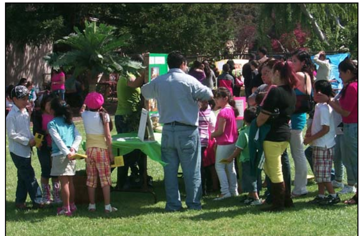
Just like in real life, palm trees lined the way for Jericho, known as "the city of palms".