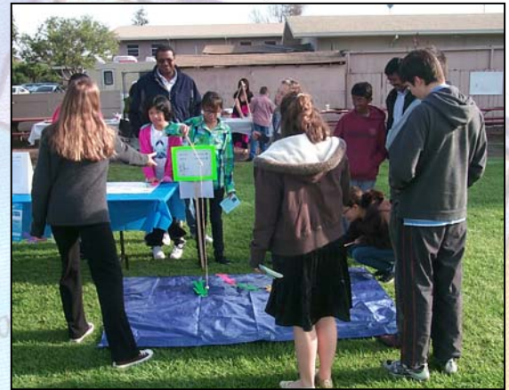
Jesus said, "I will make you fishers of men" (Mark 1:17). Sounds easy enough below along with handmade palm trees..