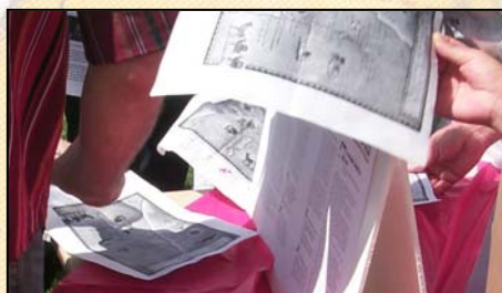
Instead of paying taxes as in Jesus' time, everyone stepped up to have their passport stamped beneath the map.