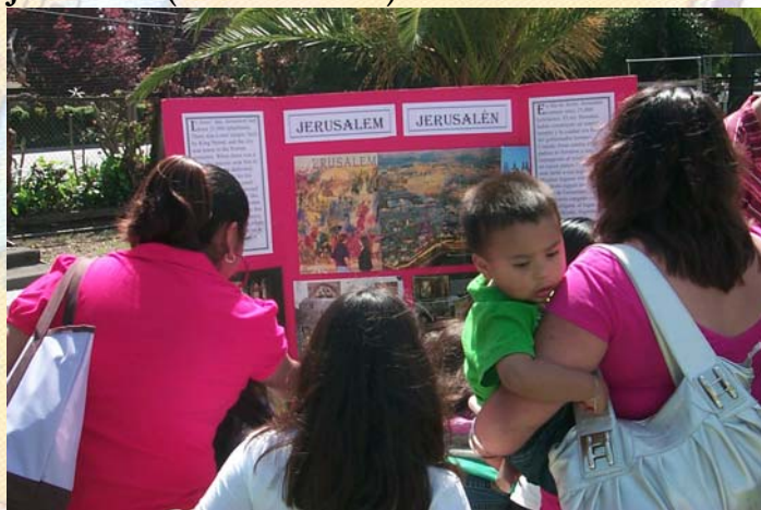
People of all ages traveled to the different locales of Jesus.

✦ Jerusalem We can praise God for His Son, Jesus. The people praise Jesus as He enters Jerusalem (Luke 19:28-40).