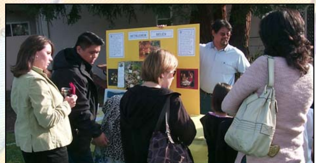
Bethlehem's story can be told anytime of the year.

+Bethlehem Jesus wants us to seek him. The wise men find Jesus (Matthew 2:1-12).